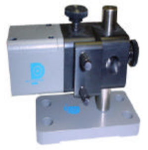
LD-16 Optical square