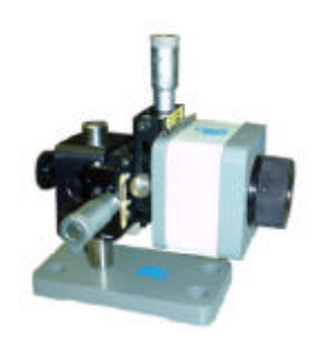
LD-42 Quad detector